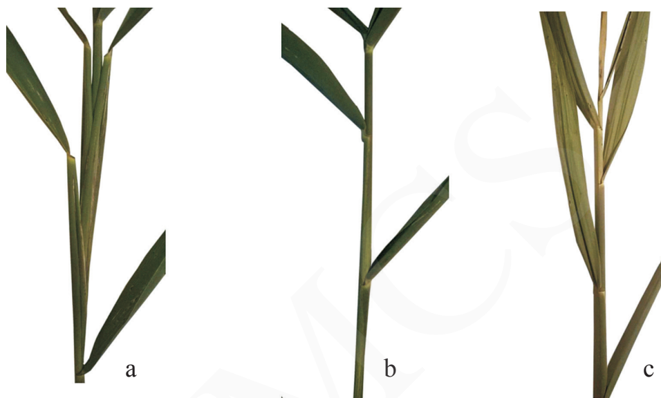
Phot. 1. Galls produced by Lipara flies (external appearance): L. pullitarsis – (a–b), L. similis – c