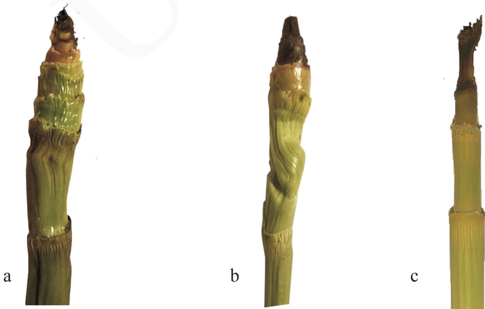
Phot. 2. Basal part of galls with leaves removed: apically widened gall of L. pullitarsis – a, rod-shaped gall of L. pullitarsis – b; gall of L. similis – c