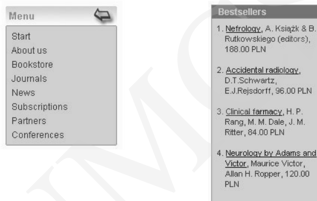
Fig. 2. The exemplary bricklets with different Decorator pattern applied

The documents set model allows to present content of some set as a bricklet [4]. The bricklet usually contains a list of documents or links placed in a given set. Depending on the renderer assigned to a certain set, the content of this set can be also rendered as an image with a name of document. If some options are set, the renderer also allows to display some additional metadata that describe the document. Nevertheless, the renderer is responsible only for the content visualization.