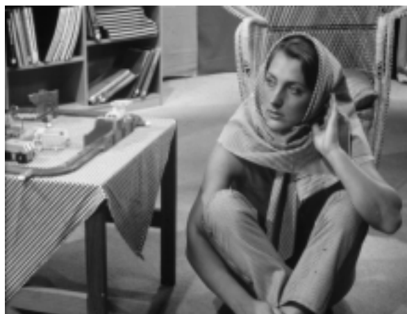
Fig. 1. Test image (“Barbara”) used in experiments

In the further parts of the paper we show the main principles of 2DKLT together with the three application areas: image compression, image scrambling and information embedding. All the experiments have been performed on the standard benchmark images. The image “Barbara” (8-bit gray-scale, 640×480 pixels) shown in Fig. 1 is employed in all cases as an example, since it contains areas of different nature (i.e. smooth, detailed, edges, etc.) and a human face, on which any unusual artifacts can be perfectly observed.