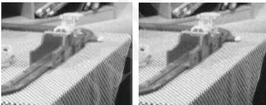
Fig. 3. Enlarged fragment of the test image compressed using the DCT-based (JPEG/JFIF) and 2DKLT-based algorithms

Figure 3 shows a comparison of the two compression methods: DCT-based (on the left) and 2DKLT-based (on the right). Enlarged fragment of the test image shows that the 2DKLT-based compression gives much more details reducing blurring of individual blocks. It is a result of optimal adaptation of basis functions for this specific image.