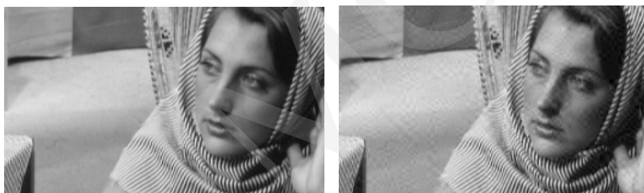
Fig. 5. Fragment of the original test image and its stegoed variant

KLT spectrum of its pixels. Hence, the message is being expanded into a longer sequence of small values e.g. binary ones. Then we have to generate a key which will determine where in the transformed blocks the elements of expanded message have to be placed. The key is a sequence of offsets from the origin of each block. It is important to place the message into the “middle-frequency” part of each block as a compromise between output image quality and robustness to intentional manipulations. This rule is especially significant in the case of images containing a large number of small details, which helps keep all the changes imperceptible. The only noticeable difference can be observed in the areas of uniform color. As an example of the embedding, the following image is presented (see Fig. 5).