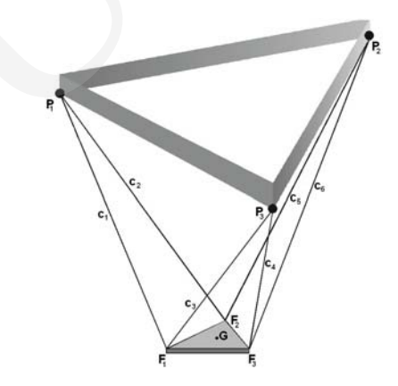
Fig. 2. The simplified scheme of the 6-DOF cable-driven crane – the inverted Stewart platform F_1, F_2, F_3 .

However, the platforms carried by the cranes of this conventional type are unstable and often unsafe. The platform is free to rotate in all directions and it can swing a lot. In practice, the determination of the desired space orientation is not possible.