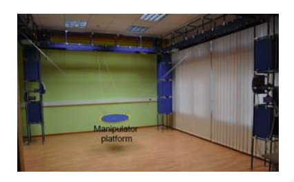
Fig. 3. The photo of described cable-driven platform.