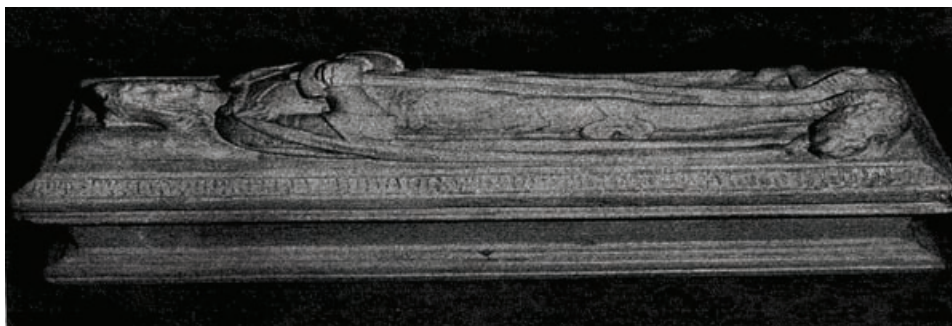
Fig. 1. The original model of Warneńczyk's sarcophagus