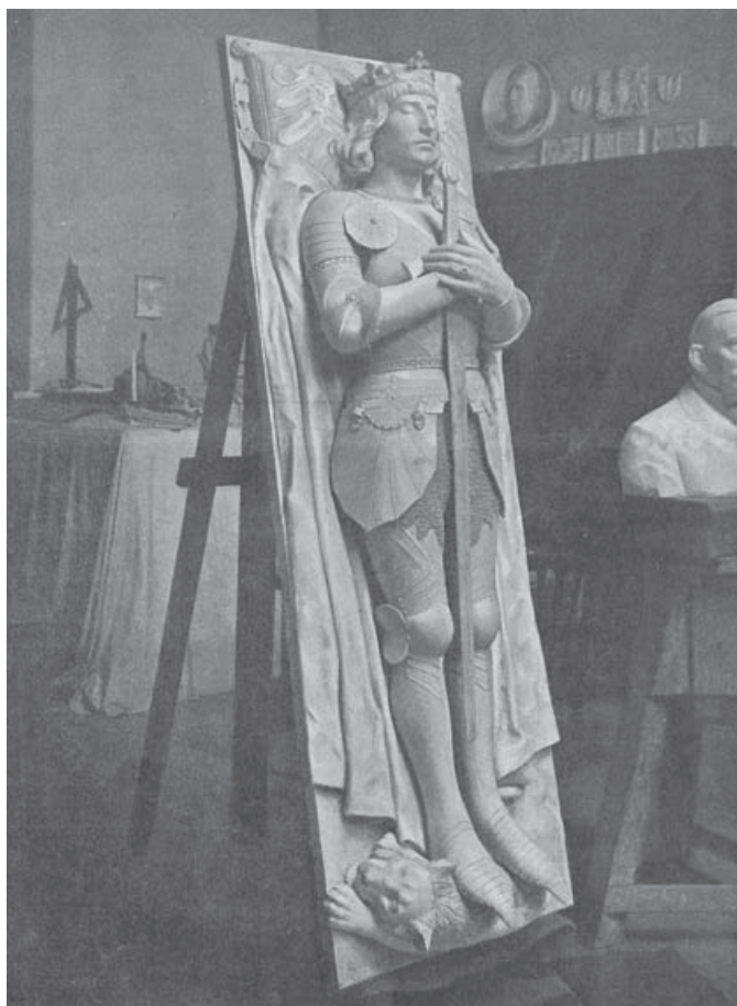
Fig. 4. Władysław Warneńczyk's tomb plaque