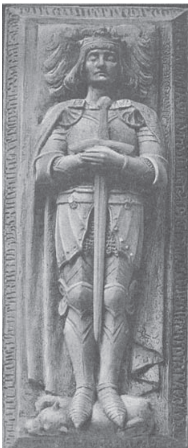
Fig. 2. Sketch of Warneńczyk's figure

Source: A. Sołtys, Pomniki Antoniego Madeyskiego na tle problemu restauracji katedry krakowskiej , "Studia Waweliana" 1994, vol. 3, p. 165.