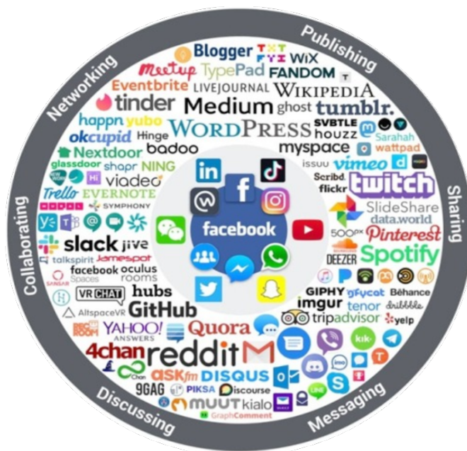
Figure 1. The social media landscape in 2020

Social media offers many opportunities to engage in dialogue with customers, as shown in Figure 1. Every year there are more and more such methods, however, it should be remembered that some of the presented ones are not yet available in different countries. Interestingly, Facebook and Twitter are the leaders in social media. A large number of Facebook users use it on average more than 30 minutes a day, and there are also other platforms such as Twitter, Instagram, Kik or Snapchat.