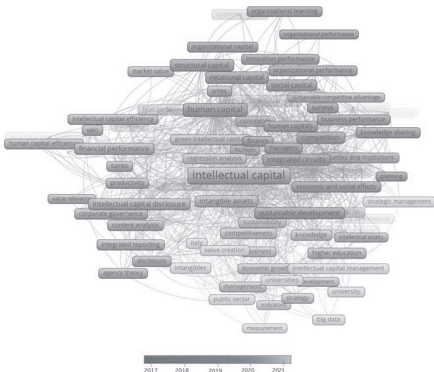
Figure 4. A map of trends in the studies on intellectual capital during the years 2017–2021

The map of trends reflects the wide scope of the issues addressed over the years. The chronological outline presented indicates that the interest in the concept of intellectual capital management still continues and the dynamics of changes in the environment of a contemporary enterprise is not at all insignificant, but the changes are evolutionary rather than revolutionary.