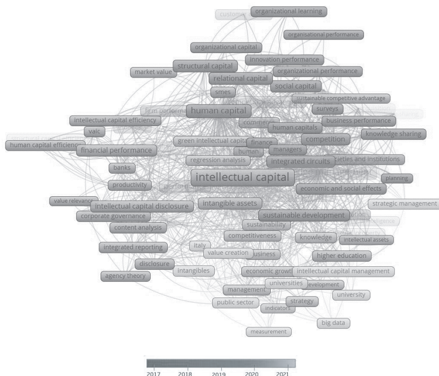
Figure 4. A map of trends in the studies on intellectual capital during the years 2017–2021

The map of trends reflects the wide scope of the issues addressed over the years. The chronological outline presented indicates that the interest in the concept of intellectual capital management still continues and the dynamics of changes in the environment of a contemporary enterprise is not at all insignificant, but the changes are evolutionary rather than revolutionary.