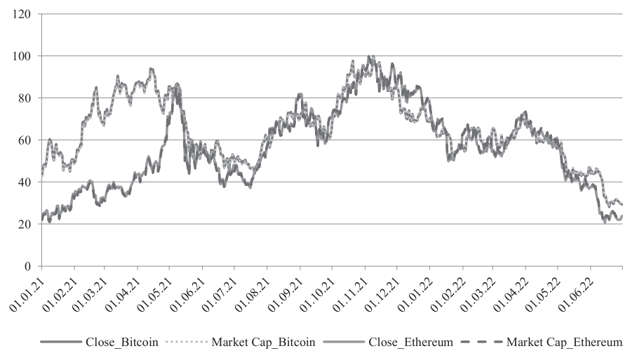
Figure 3. Standardized time series of Bitcoin and Ethereum quotations by Close and Market Cap categories in the period January 2021 – June 2022