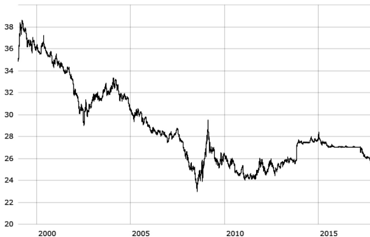
Figure 3. Fluctuations in the crown's rate in relationship to the euro, 2000–2017