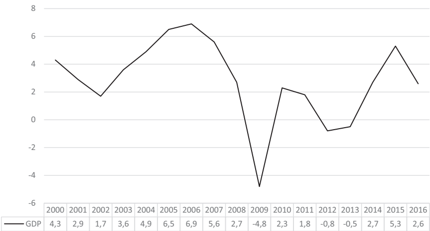
Figure 1. Dynamics of GDP in the Czech Republic (2000–2016)

At the beginning of 2013, the Czech economy was affected by the second wave of the crisis. That was caused by the European debt deficit and the effects of internal fiscal consolidation. These effects appeared mainly on the consumption side – the