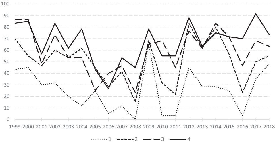
Figure 1. The average percentage of cases in which the returns were normally distributed, taking into account all tests performed and all indexes, presented for each year and for each returns' interval