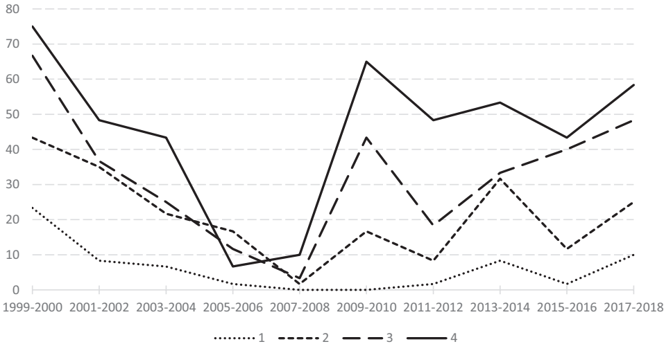
Figure 2. The average percentage of cases in which the returns were normally distributed, taking into account all tests performed and all indexes presented for each two-year sub-period and each returns' interval