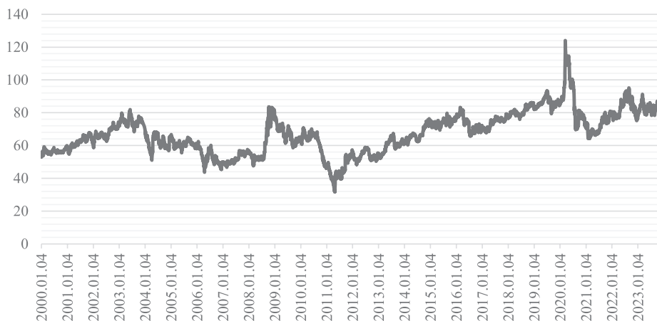
Figure 1. Price relation between gold and silver (gold/silver ratio) in the period 2000–2023

Adding to that, relating our findings to gold/silver ratio from the previous centuries, as we entered the 21 st century, irreversible changes in monetary policy took place, which meant that we no longer have to deal with the gold/silver ratio at such levels as in the 19 th and 20 th centuries. However, it can be noticed some repeatability in the channels (Figure 1) in which this ratio moves and the value of the 80:1 level for trends, which is both the level of support and resistance.