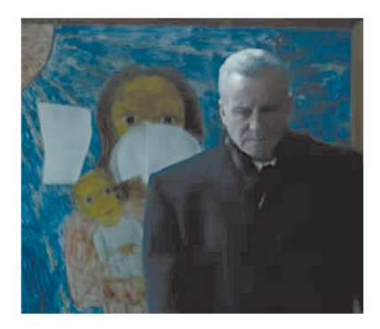
Figure 2: 'Silent' Woman in the Poster

This metaphor develops into a sub-metaphor CHORNOBYL IS ESPIO-NAGE. The very beginning of the series (Episode 1 "1:23:45") introduces the viewers to the metaphor CHORNOBYL IS ESPIONAGE. Under disguise of darkness Legasov leaves his flat in an attempt to hide the cassettes in a small air vent in a dark alley next to his building. He quickly passes through the beam of a streetlamp to avoid being noticed by a man from the surveillance car parked nearby. The source domain is recruited visually – by darkness, subdued light, and Legasov's furtive behaviour – and it is reinforced by the suspenseful tunes of the musical mode.