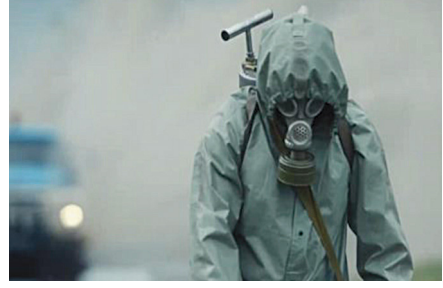
Figure 4: Ripping up the Fields