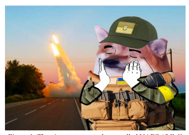
Figure 1: The picture presents the so-called NAFO 'fella'

Pro-Ukrainian memes against the 2022 Russian invasion play a number of significant roles. Apart from being comforting and relieving, they are informative as they help disseminate the current state of affairs in Ukraine and stand up to Russian propaganda. Memes become vessels of information or commentary on current events even on the official Twitter account of Ukraine (https://twitter.com/Ukraine). There are a number of pro-Ukrainian social media movements such as Saint Javelin, NAFO (North Atlantic Fellas Organisation) or Ukrainian Memes Forces that fight Russian disinformation in the form of memes and work as fundraisers for Ukraine. It is characteristic of NAFO that it bases memes on the image of the Shiba Inu dog, known on the internet as Doge (Figure 1). Their presence and activity have been recognised by Ukrainian government officials, i.e. Ukraine's Minister of Defence, Oleksii Reznikov, who changed his profile picture to a NAFO meme (Hamill-Steward, 2022).