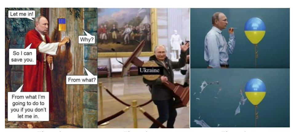
Figure 2 Figure 3 Figure 4

The first meme (Figure 2) was created on the basis of the original painting known as Jesus at the Door (Jesus Knocking at the Door) by Del Parson that refers to a scene from the Primary manual 6-36; Revelation 3:20. Here, Jesus's head has been replaced with Putin's. In tune with the FACE FOR PERSON metonymy, the provided picture seems sufficient to understand that the person knocking at the door is the president of Russia. Another significant element is the change of colour visible in the upper part of the door window: the yellow light (a warm glow from within that is probably a reflection of an indoor fireplace) is replaced with a blue shadow which together with the original lower part represents the blue and yellow flag of Ukraine. Thus, it can be said that the visual layer represents Vladimir Putin knocking at the door of Ukraine. The verbal layer completes the visual one, mak-