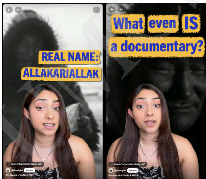
Fig. 6 Stills from YouTube short "Was Nanook of the North Fake?" posted by @pbsorigins, https://www.youtube.com/shorts/459aD4QxPBE

2012, Tagaq and a group of collaborators composed a new soundtrack for Nanook that was first performed at the Toronto International Film Festival that year. In doing so, Tagaq and company worked to counter the film's problematic legacy through sonic intervention, an eclectic soundscape centering Tagaq's neo-traditional Inuit throat singing. "Even though I have no doubt in my mind that Robert Flaherty had a definite love for Inuit and the land," she says, "it's through 1922 goggles" (ibid.). As such, the composition of a new soundtrack for the film is an effort to reclaim Nanook in a way that does not call for the film's erasure, but rather a thorough reconsideration in light of its enduring impact on the Inuit people.