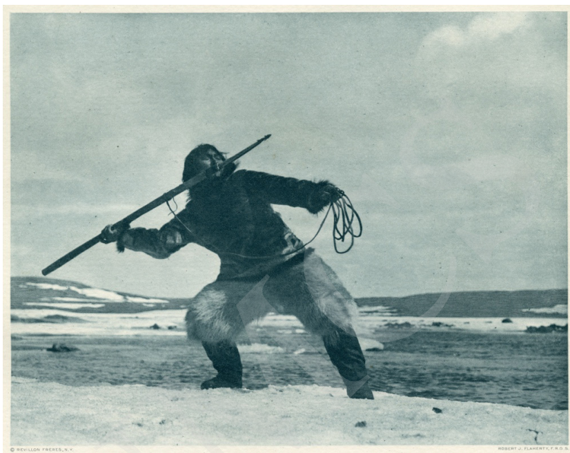
Fig. 2 Publicity still from Nanook of the North (1922) produced by Révillon Frères.

Despite Ruby's insistence on a moderated approach to Flaherty's work, a consistent critique of Nanook rests on the film's skewed portrayal of Inuit life. On the one-hundredth anniversary of the film's release, The Economist (2022) published an article tellingly titled "The vexed legacy of 'Nanook of the North.'" The subtitle read: "A century ago, Robert Flaherty released a pioneering documentary film. The problem was that it was staged." A more damning critique comes from Adam Piron (2022) writing for Documentary Magazine , bluntly referring to the legacy of Nanook as a "100-year stain." Indeed, a perfunctory Internet search for "Nanook" and "staged" returns hundreds of results. While many are clickbait, others like those from The Economist and Documentary Magazine seem caught in a kind of feedback loop, applying contemporary critiques about issues of power, authority, and authenticity in documentary film to Nanook , a film Flaherty never claimed to be objective.