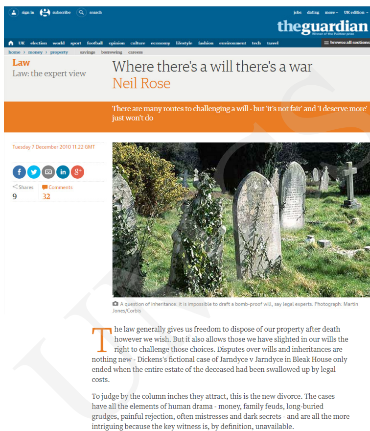
Figure 3. Fragment of the article “Where there’s a will there’s a war” from The Guardian ’s official website (available at http://www.theguardian.com/law/2010/dec/07/neil-rose-will-disputes ; retrieved March 23, 2015).