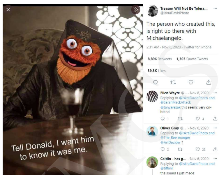
Fig. 3: Example of Gritty meme with high intertextuality by @IskraDavidPhoto (2020)

While the framing is similar to the previously discussed examples, in memes such as this 3 , several elements come together to create the multi-layered joke of the meme: Gritty's head is super-imposed on Olenna Tyrell, a character from HBO's Game of Thrones series. The show's quote is slightly altered to refer to Donald Trump, once again taking the place of a hated villain, this time Game of Thrones ' king Joffrey. Denisova (32) points out that "memes are coded messages and therefore can be confusing for various people: members of the audience may have varying abilities and skills to read the 'code'" in such cases. Here it is both necessary to know the context of the quotes – Olenna admitting to the murder of a tyrant king – and the event it references, with the implied metaphorical murder being Trump's loss of the election, which was attributed to the votes of leftist Philadelphians, as Pennsylvania flipping blue was seen as the key event cementing Biden's victory, metonymically referenced through Gritty.