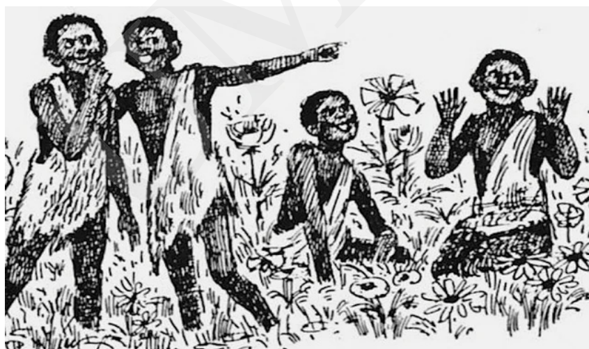
Picture 1. Black Oompa-Loompas illustrated by Faith Jaques in 1977 (copied from Treglown 1994).

The picture below presents illustrations in the first British edition in 1977, made by Faith Jaques.