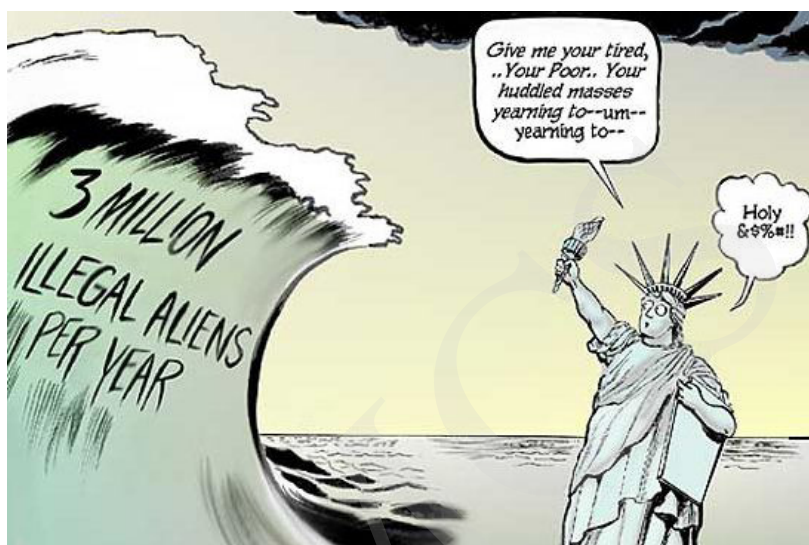
Figure 1. The alien tsunami that scares even the Lady Liberty (CNS News.com, 2010)

Source: E. Pluribus Unum. "Cartoons." 2017. Accessed June 10. https://epluribusunumjcom2010.wordpress.com/cartoons/ .