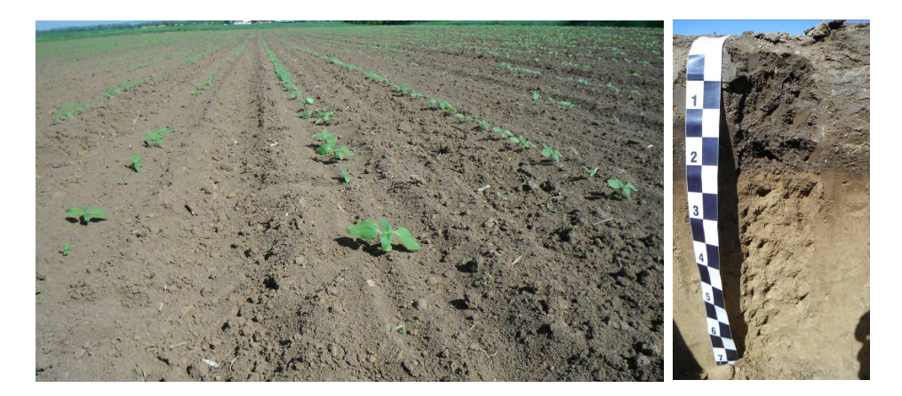
Fig. 2. Haplic Chernozem (Siltic, Anthric) with thickness of A horizon less than 25 cm. Locality: Jaslovce (western part of Slovakia)

The occurrence of dark-coloured humus horizons is a reflection of more or less historical hydromorphic phase in soil cover development where the accumulation of humus under recent conditions is rarely a predominant soil-forming process. The change in the groundwater level contributed to historical development of soils under changed hydromorphic, semihydromorphic and automorphic conditions often on small areas. In addition, according to some micromorphological studies, the brown diffusely dispersed forms of humus are often visible (Čurlík 1975). It was confirmed also by detailed quaternary geological research, in which such sediments are described as deluvial or proluvial (Vaškovský and Halouzka 1976, Koštialik 1974). After the Würm period, the origin relief by the planation process has been created with a smooth relief of colourful mosaic of soils (in this case mosaic of black and bright soils – Phaeozems and Planosols) (Fig. 4).