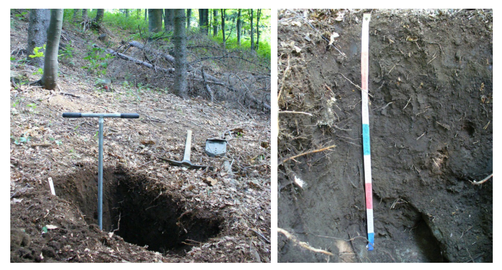
Fig. 6. Dystric Umbric Andosol (Fulvic, Loamic, Thixotropic). Locality: Suchá Hora in the Kremnica Mountains (central Slovakia)