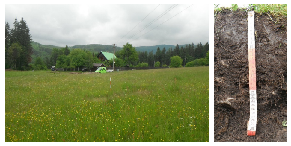
Fig. 5. Skeletic Umbrisol (Andic, Loamic). Locality: Pol'ana - Kalamárka (central Slovakia)