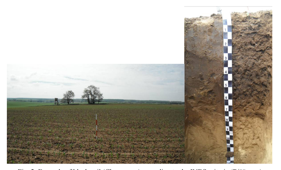
Fig. 2. Example of black soil (Chernozem) according to the INBS criteria (Rišňovce)

from the eastern part of the Danubian Lowland ( Podunajská nížina ) (Vaškovský and Halouzka 1976, Koštialik 1974). In addition, there are also "black soils" (outside of the INBS criteria) with a shallower A horizon (<25cm) which are also situated in the soil cover of Slovakia probably under the influence of erosion (eroded forms) – Fig. 3 (Chernozem). A question arises whether the INBS criteria for black soils evaluation are reliably sufficient or not? Basic statistical characteristics of black soils in Slovakia according to the INBS criteria are given in Table 1.