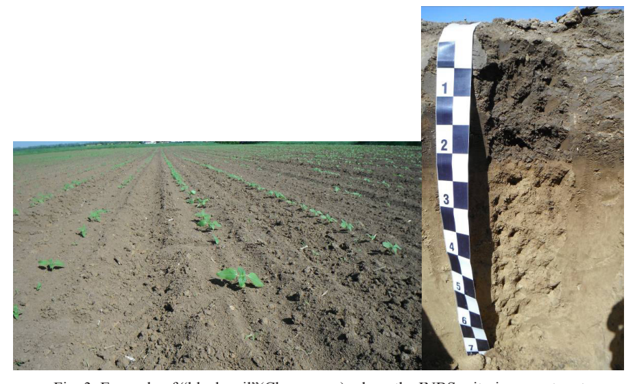
Fig. 3. Example of "black soil" (Chernozem) where the INBS criteria are not met (A hor. < 25 cm) (Jaslovce)