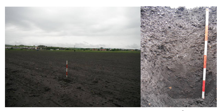
Fig. 4. Example of black soil (Phaeozem) with buried A horizon (Žíp)

Note: X_{min} – minimum value, X_{max} – maximum value, X – arithmetic mean, Sd – standard deviation, Vc – variable coefficient, SOC – soil organic carbon, BS – base saturation, N_{tot} – total nitrogen, HA – humic acids, FA – fulvoacids, Q^4 – colour quotient