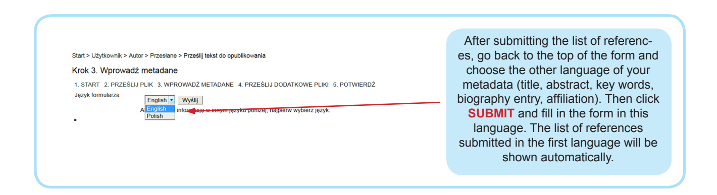
Next, click SAVE to properly submit the article.

The form in English allows for submitting metadata in other languages, e.g. French.