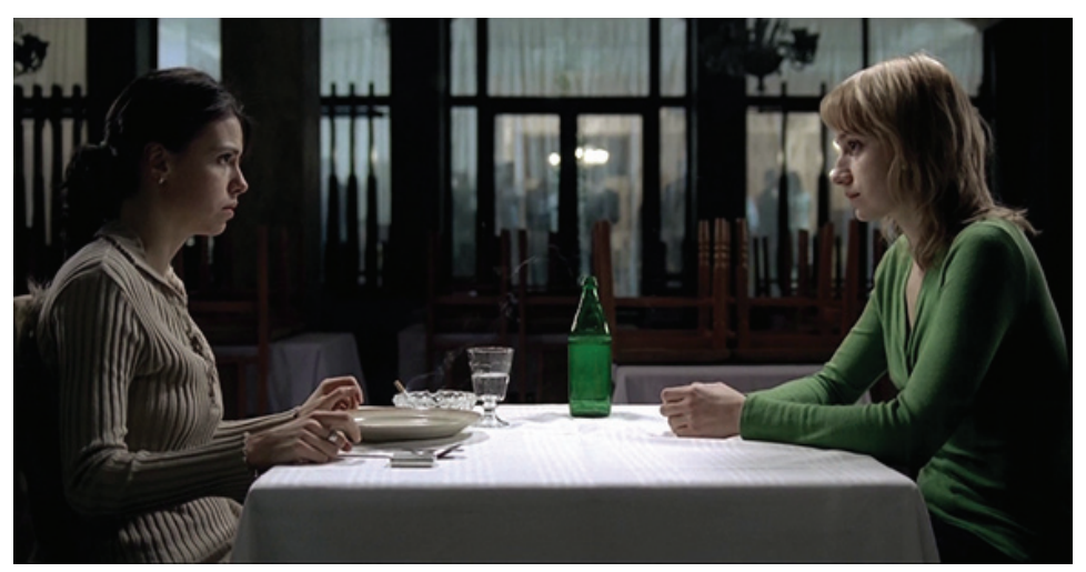
Fig. 2. Impasse (4 Months, 3 Weeks and 2 Days).

Impasse is thematized in the endings of 4 Months, 3 Weeks and 2 Days and Beyond the Hills through long, silent and mournful sequences of non-action. This are the moments when the protagonists reflect on the quality of the help they sought and the price they had to pay for it. But most importantly, they reflect on their condition as vulnerable and question it. In 4 Months, 3 Weeks and 2 Days the two protagonists sit at the table and look at each other or through the window realizing that there is nothing more to say about what happened other than to ask why it did happen. Suspension of action is constructed not only by the silence of the characters, but also, by contrasts within the frame. In the background there is a noisy wedding, in the offscreen foreground, on the street, several cars pass by, this action being indicated by lights reflected in the window of the restaurant and the offscreen sound.