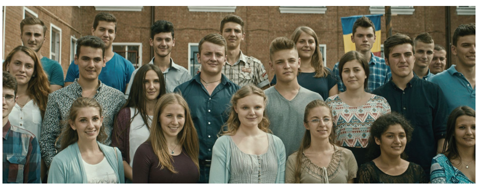
Fig. 3. Generation split ( Graduation ).

indecision and suspension of governance 'when the former Master-Signifier, although it has already lost its hegemonic power, has not yet been replaced by the new one'30.