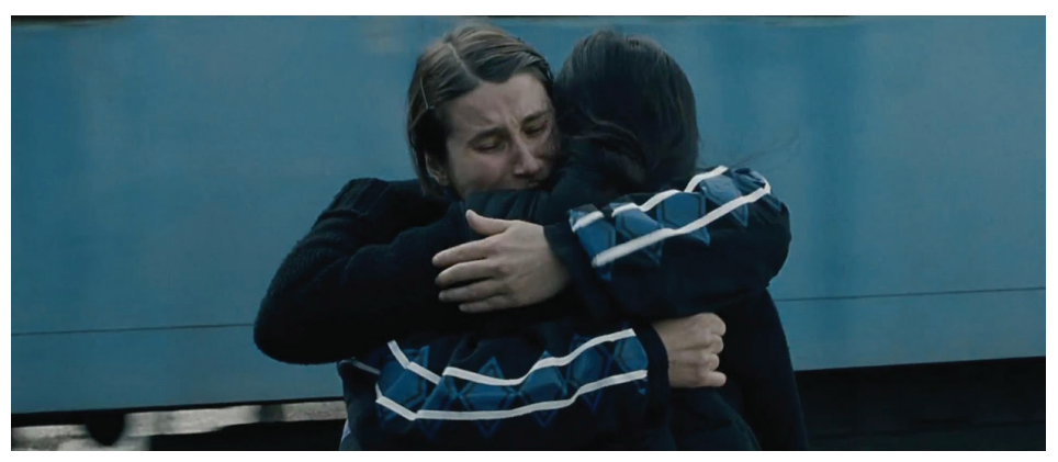
Fig. 1. Vulnerable protagonists (Beyond the Hills).

These scenes are the ones in which the emotions of the characters are the most animated and corporealized. They rather constitute exceptions within the emotional landscape developed by Mungiu. The predominant reaction of his protagonists to their exposure to abuse is muted. His characters have a resigned or sometimes embarrassed reaction to their powerlessness and entrapment. Mungiu's films do not seek to exploit dread or outrage. Characters seem to have grown accustomed to function under abusive conditions.