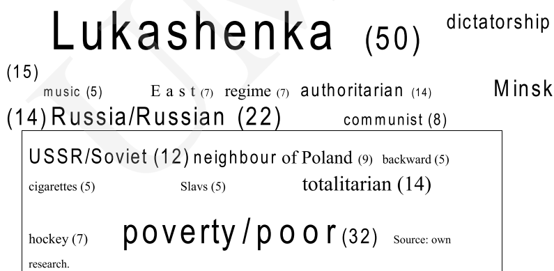
Fig. 2. The list of the top associations with Belarus and/or Belarusians provided by Polish university students. Larger fonts indicate that the association appeared more often. The numbers in brackets indicate how many respondents associated this word with Belarus and/or Belarusians

Answering the questions „Please enter the three main words or phrases, which you associate with Belarus and/or Belarusians” the majority of respondents wrote several words or phrases. In total, respondents provided a lot of associations – 172 different words and phrases were mentioned 25 . However, the majority of words were repeated just once and only a few of them were repeated systematically. The most frequently occurring association – Lukashenka , was written by 50 students, which is still quite a low number (35 per cent of the total amount of respondents). Poverty and Russia/Russian were mentioned respectively by 32 students (13 per cent) and 22 students (15 per cent). The other main associations: dictatorship , authoritarian , Minsk , USSR/Soviet were repeated ten to twenty times (14 to 7 per cent). Thus, respondents provided surprisingly few associations with Belarusians . Moreover, all of the main associations concerned the politics or economy of the state, while the culture, people, their national characteristics and mentality were neglected. That confirms the results of the previous studies, stating that Belarusians still remain almost unknown and do not evoke many associations among Poles. The list of top associations is shown in Figure 2.