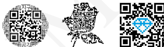
Figure 4. OR codes: a) ACBC S.r.l.; b) Noah s.r.l.; c) Trail Systems Oy

The mark exhibited in Figure 3a consists of a standard QR symbol compounded with verbal element. Distinctive character in that example is likely be attributable first to the distinctive character exhibited by the verbal element per se and, secondly, to the relative subservience of the standard QR symbol. On an interesting note, it is observed that, having been filed by the same applicant, the mark in Figure 3b stands to be a further customized version of that exhibited in Figure 2b. The different findings as regards the distinctive character thereof might likewise be ascribed to the additional (and distinctive) verbal element contained in the former. Moreover, chromatic elements (i.e., the blue shopping bag icon surrounding the code symbol and alignment patterns colorized alike) seem to provide further dissimilation from a standard code symbol. The remainder of specimens given in Figure 3 similarly incorporate verbal, chromatic as well as certain figurative elements, resulting in an overall distinctive character. 95