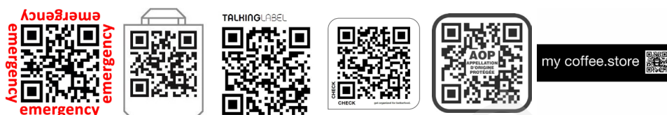
Figure 2. QR codes: a) emergency; b) Powa Technologies Limited; c) Talking Label; d) CHECK get organized for better food; e) AOP appellation d'origine protégée; f) my coffee.store

Source: EUTM 012609616, registration sought in classes 9, 16, 41; EUTM 014396766, registration sought in classes 9, 35, 36, 38, 42; EUTM 011298155, registration sought in classes 29, 30, 32, 33, 35, 41; EUTM 016530461, registration sought in classes 9, 35, 38, 42; EUTM 010266203, registration sought in classes 9, 32, 33, 34; EUTM 018061024, registration sought in classes 35 and 43.