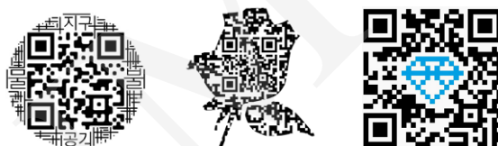
Figure 4. OR codes: a) ACBC S.r.l.; b) Noah s.r.l.; c) Trail Systems Oy

The mark exhibited in Figure 3a consists of a standard QR symbol compounded with verbal element. Distinctive character in that example is likely be attributable first to the distinctive character exhibited by the verbal element per se and, secondly, to the relative subservience of the standard QR symbol. On an interesting note, it is observed that, having been filed by the same applicant, the mark in Figure 3b stands to be a further customized version of that exhibited in Figure 2b. The different findings as regards the distinctive character thereof might likewise be ascribed to the additional (and distinctive) verbal element contained in the former. Moreover, chromatic elements (i.e., the blue shopping bag icon surrounding the code symbol and alignment patterns colorized alike) seem to provide further dissimulation from a standard code symbol. The remainder of specimens given in Figure 3 similarly incorporate verbal, chromatic as well as certain figurative elements, resulting in an overall distinctive character. 95