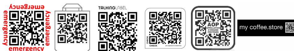
Figure 2. QR codes: a) emergency; b) Powa Technologies Limited; c) Talking Label; d) CHECK get organized for better food; e) AOP appellation d'origine protégée; f) my coffee.store

Source: EUTM 012609616, registration sought in classes 9, 16, 41; EUTM 014396766, registration sought in classes 9, 35, 36, 38, 42; EUTM 011298155, registration sought in classes 29, 30, 32, 33, 35, 41; EUTM 016530461, registration sought in classes 9, 35, 38, 42; EUTM 010266203, registration sought in classes 9, 32, 33, 34; EUTM 018061024, registration sought in classes 35 and 43.