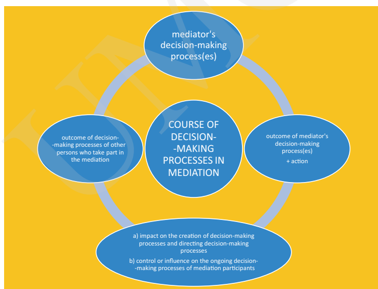
Figure 1. Course of decision-making processes in mediation

all mediation participants. The decision-making participation will consist of a real collective effect on the outcome of decisions made during mediation. Any decision, except for the first one which initiates the mediation process, will be a consequence of previous decisions (see Figure 1). I accept that competent to make decisions in mediation are ‘actors’, i.e. the mediators, parties, attorneys, and other persons involved in mediation (e.g. experts). 43 The mediator plays an essential role in the process, enabling mutual communication 44 and organising the resulting information system. This perception of decision-making processes in mediation entails that we focus on the actual course of decision-making and not on the formal powers to make a decision. At the same time, the course of decision-making processes takes into account the interaction of decision-making processes and actions of all people involved in mediation, taking into account the strong interconnection. 45