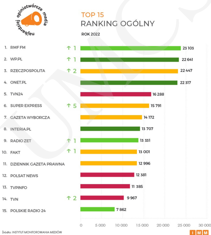
Figure 2. Results of press citations research – general ranking

Source: Polskie Badania Czytelnictwa, Raport AUDYT PBC (dawniej ZKDP). Rozpowszechnianie Tytułów Prasowych w 2022 r. , https://www.pbc.pl/wp-content/uploads/2023/03/Raport_Audyt_PBC_2022.pdf (access: 10.4.2023), p. 3.