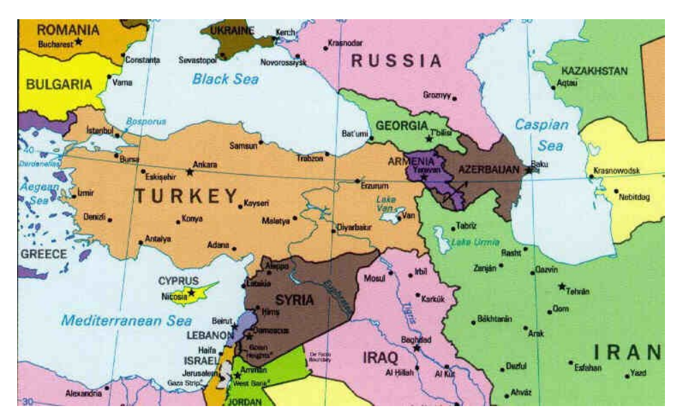
Map 1. Turkey's geopolitical location

The "geographical depth" is conditioned by a geostrategic location of Turkey between Europe and Asia, in the proximity of Africa and in the neighbourhood of critical regions of the world such as: the Balkans, the Middle East, Central Asia and South Caucasus<sup>5</sup>. A specific location makes Turkey a "central country" possessing a "strategic depth" and constitutes a "bridge" between Christian and Islamic worlds.