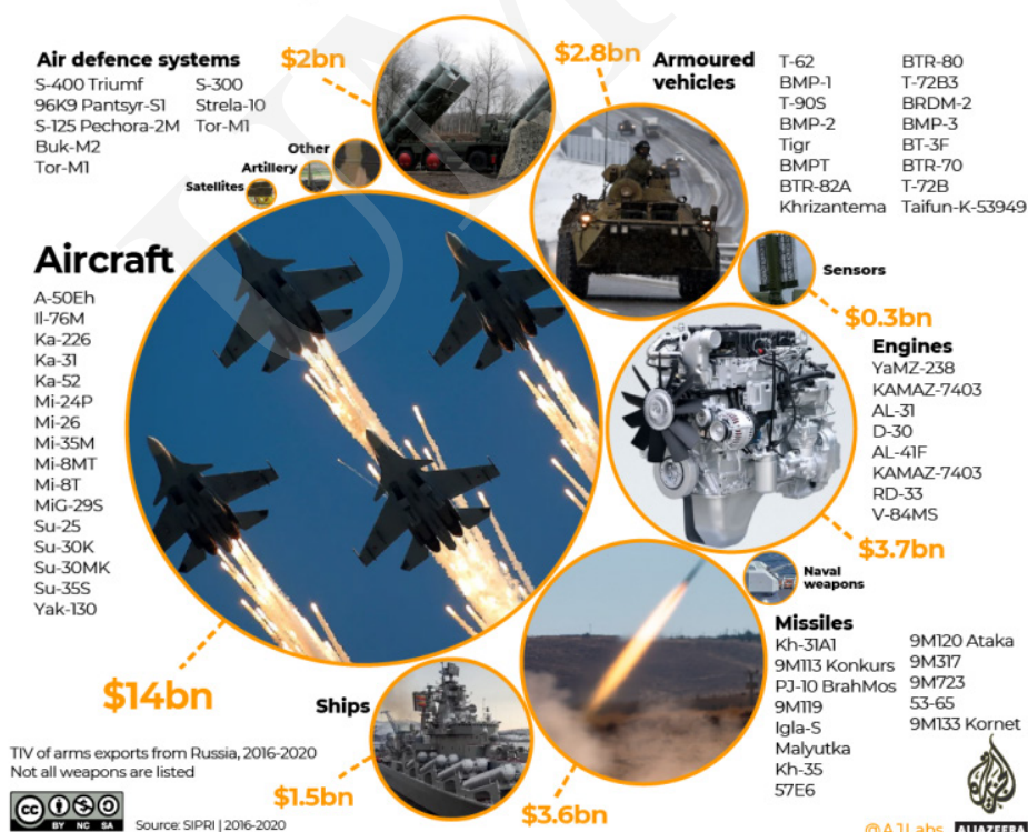
Fig. 2. Types of Weapons, which Russia exported to the International Market within 2016–2020

Half of Russia’s arms exports are aircraft. Many Russian weapons are upgrades to its Soviet-era arsenal but it is developing more advanced systems . Between 2016 and 2020, Moscow sold $28bn of weapons to 45 countries.