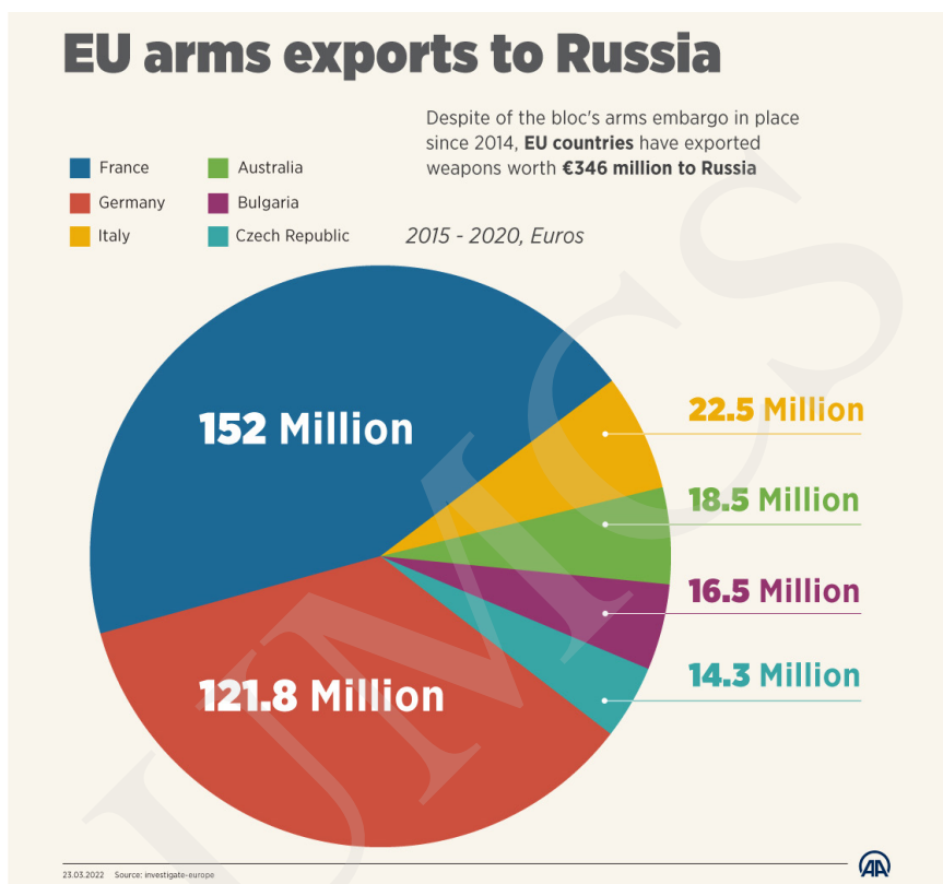
Fig.3. EU Arms Exports to Russia within 2015–2020